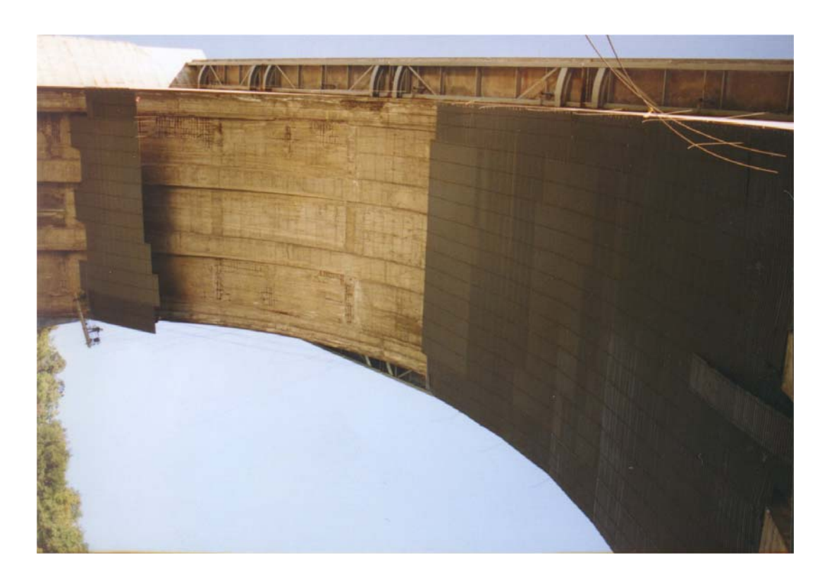
Partially installed Cable/Metal Deck Platform Conforming to the Concrete Arch