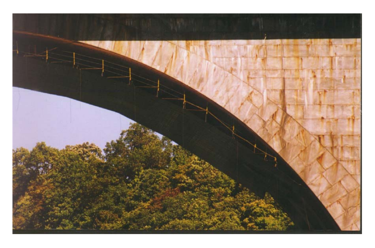
Partially installed Cable/Metal Deck Platform Conforming to the Concrete Arch