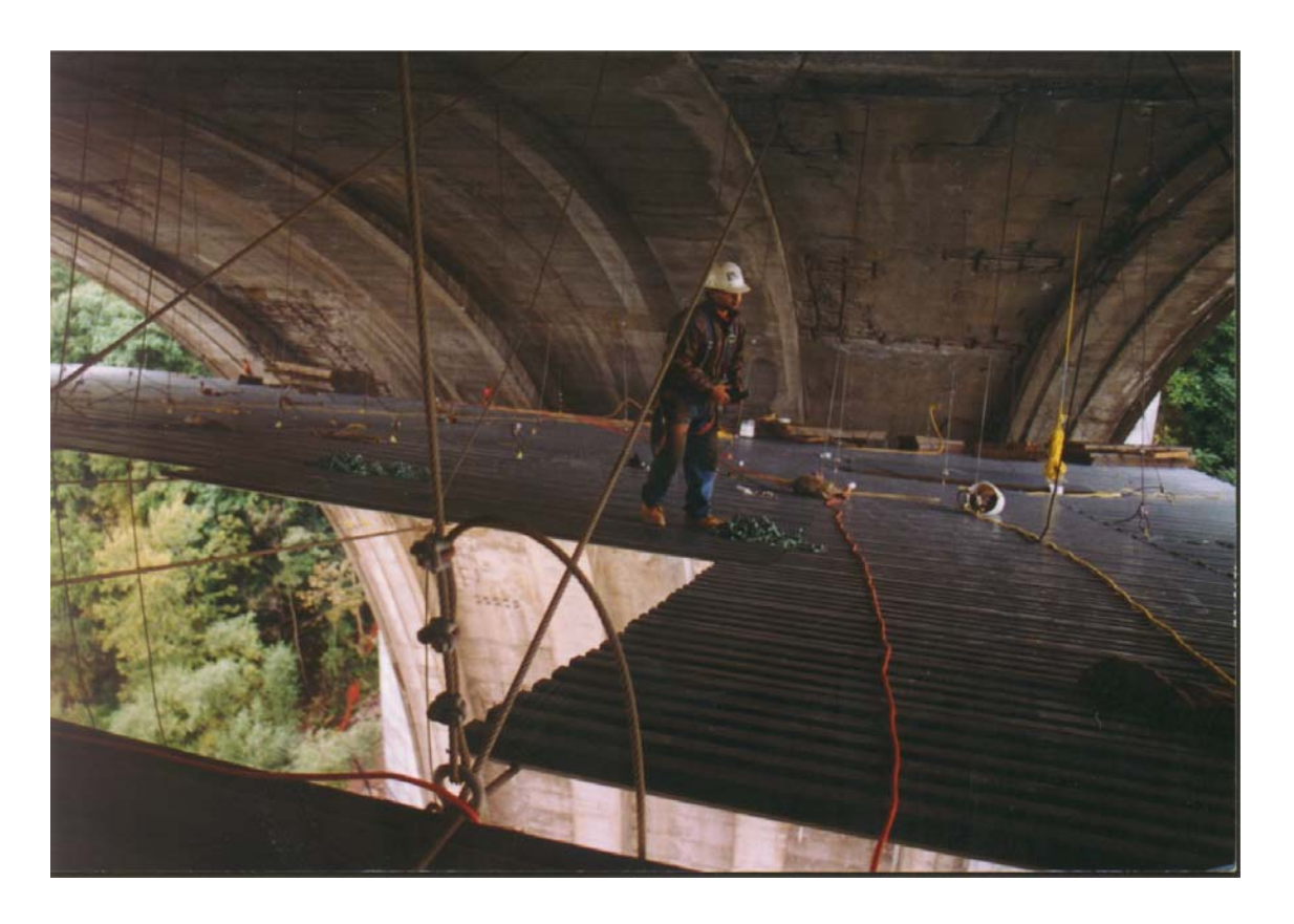
Partially installed Cable/Metal Deck Platform Conforming to the Concrete Arch